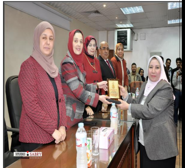
Organized a message event team (six hats) from 17/2 to 20/2