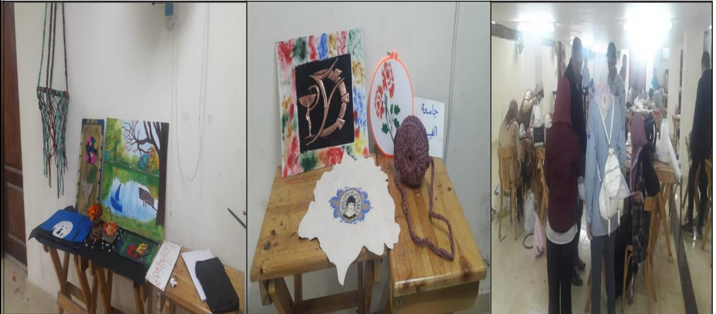
The closing ceremony and distribution of prizes for the first pharmacy festival for students of Faculties of Pharmacy in the Republic