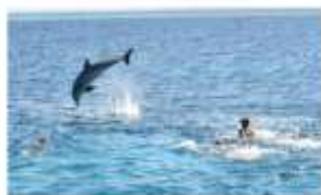
Snorkeling and Swimming with Dolphins