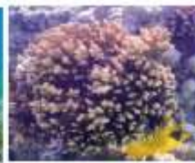
Snorkeling and Diving