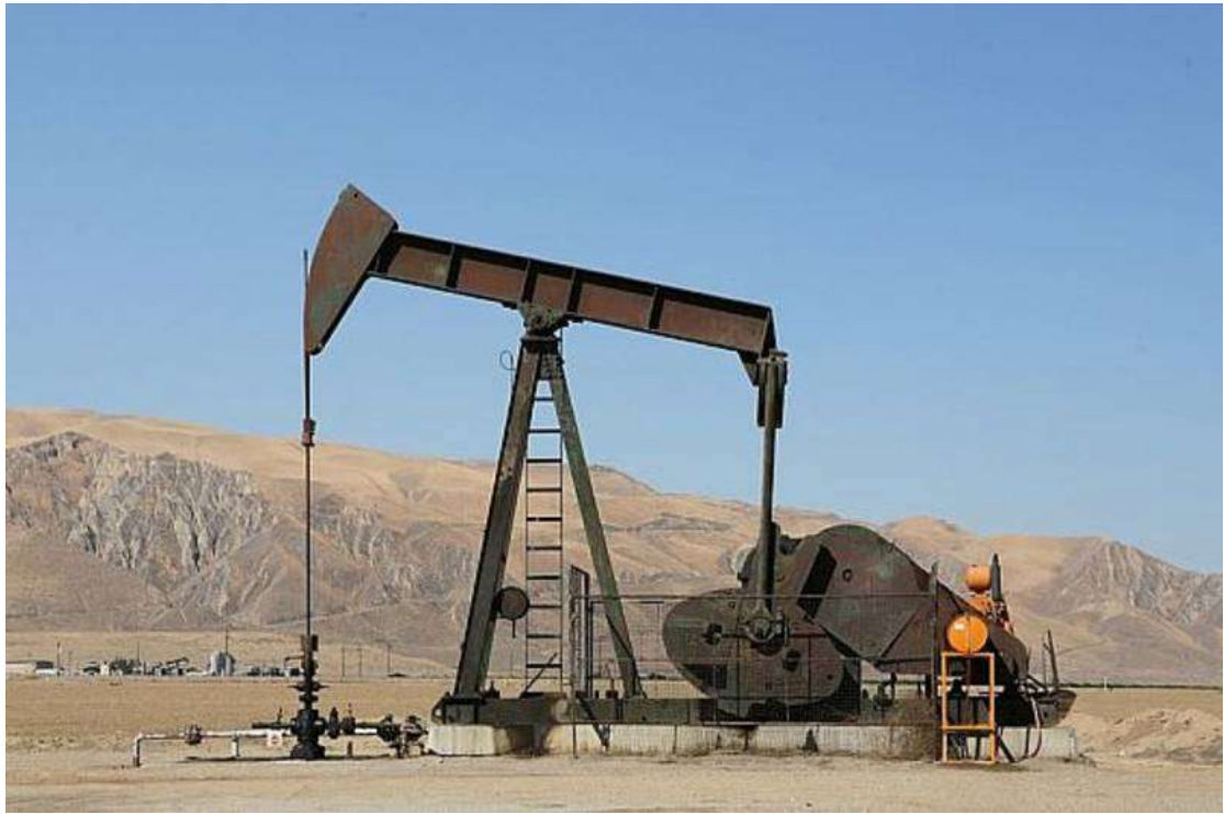
For compressing air at oil field.