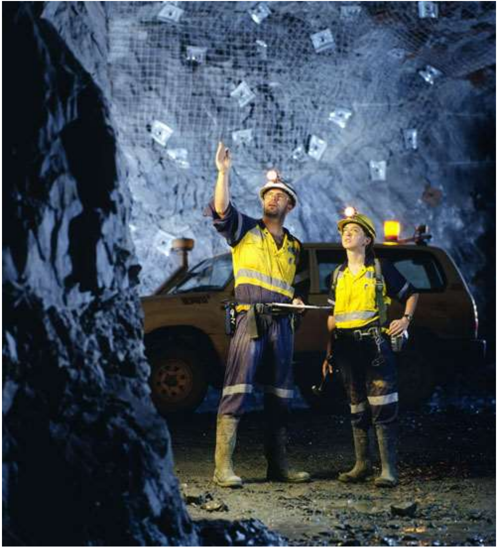
Safety in underground mine.