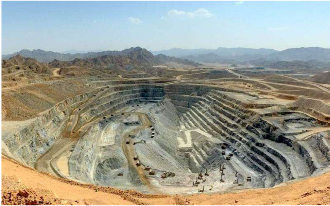
El-Sokari Gold Mine (after Cintamine Gold Mining) at the Eastern Desert of Egypt.