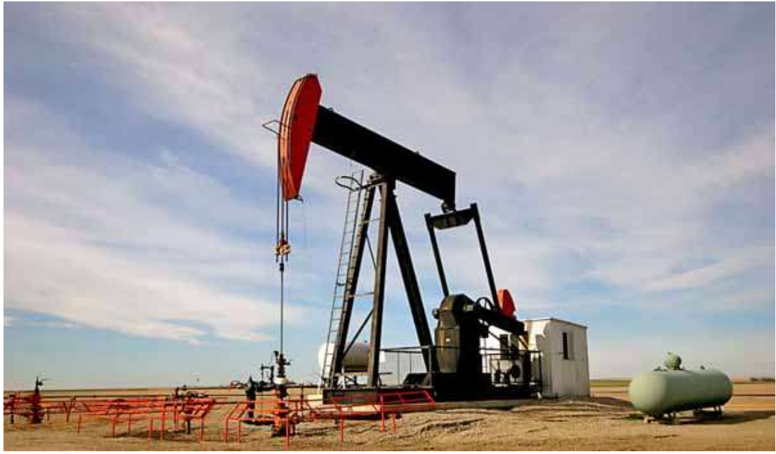
Compressor for compressing air to Oil Field.