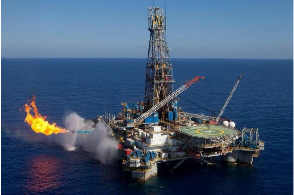
Zohr Gas off-shore Field at Mediterranean Sea.