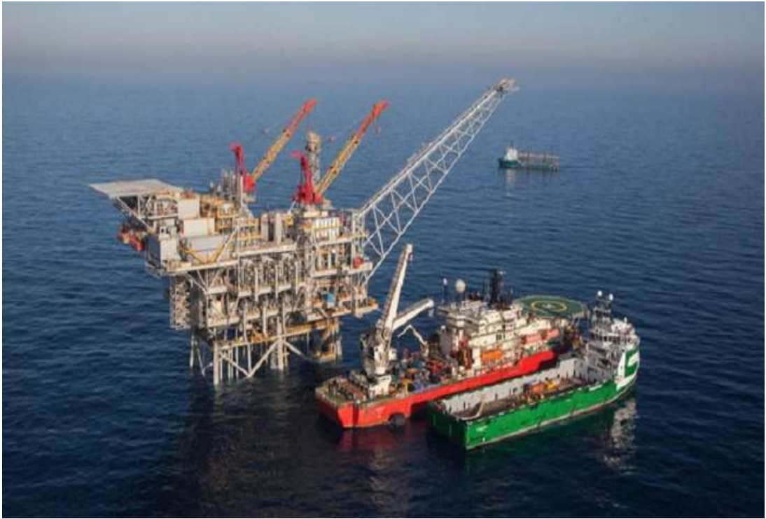
Off Shore oil field.