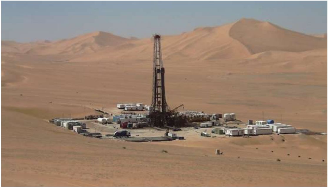
Rasheid Petroleum Company - Gas Field