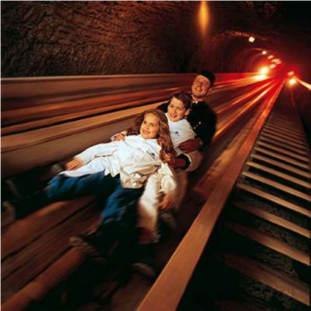
Salzburg – Austria Salt Mine.