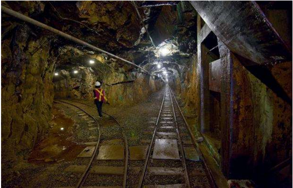
Gold Mine at Kanada.